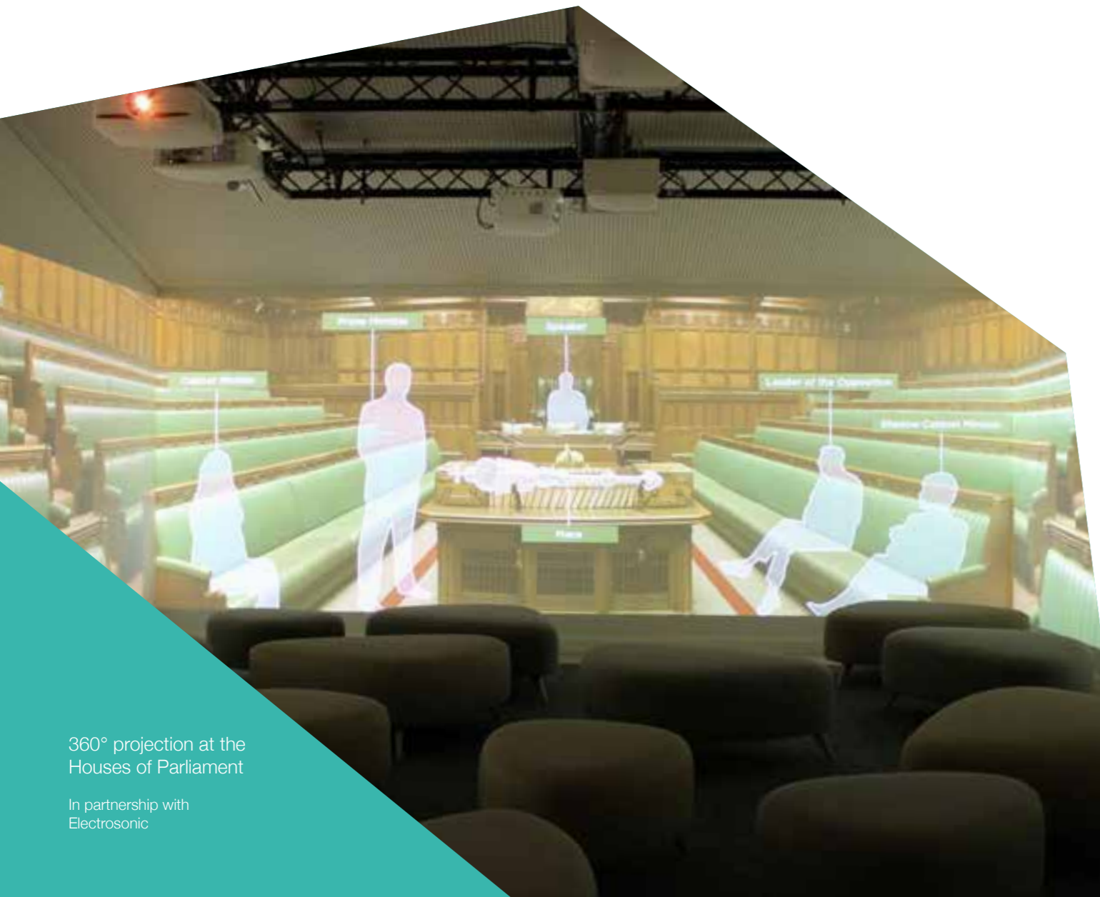
360° projection at the Houses of Parliament